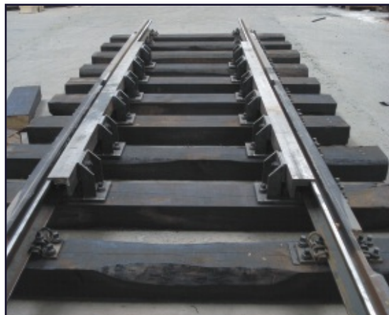
Bridge expansion rails