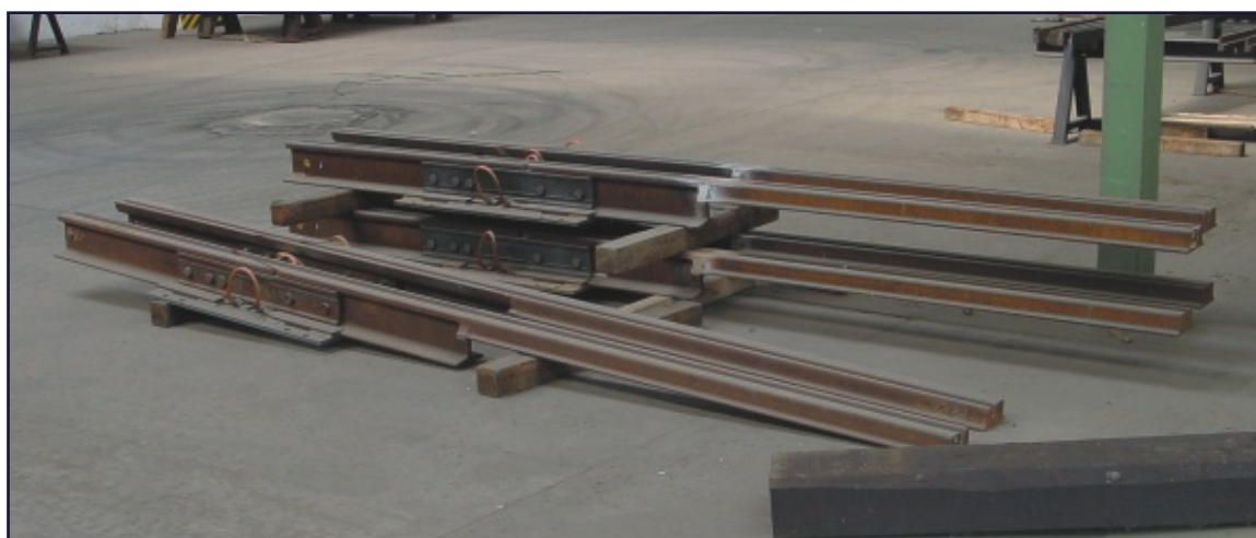
Transition rail with an inserted expansion rail