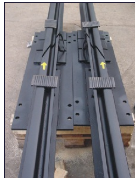
Ri60N expansion rails