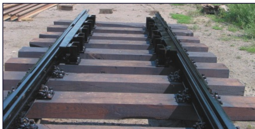
Bridge expansion rails

tel.: +420 284 810 852 fax: +420 284 820 493 e-mail: pstroj@pstroj.cz www.pstroj.cz